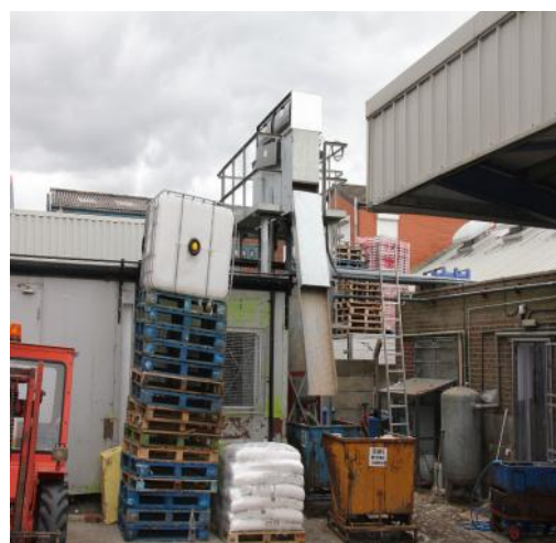
Model 600 SD Separator